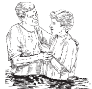
Ordinance of Baptism