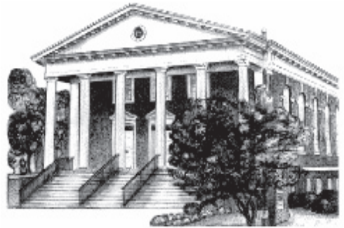
225 WEST EARLE STREET GREENVILLE, SOUTH CAROLINA 29609